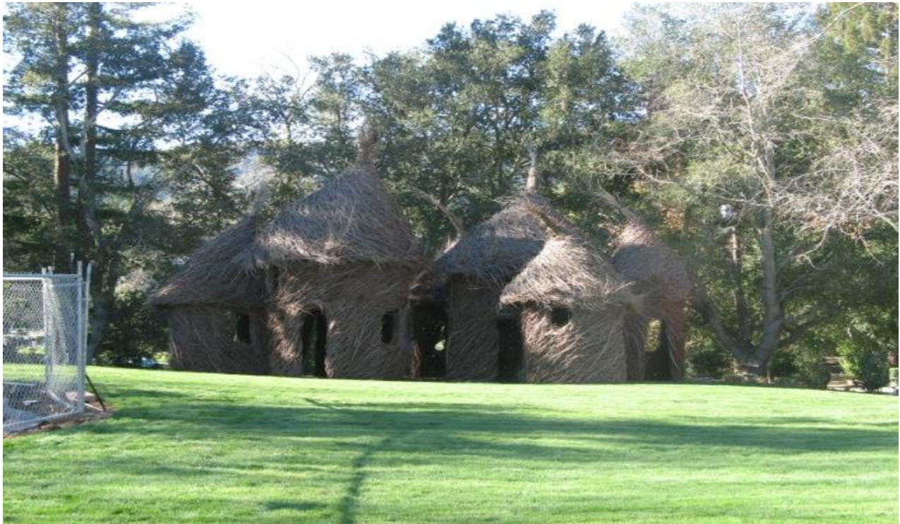
Native Bentgrass™ - Holland/Yates Residence – Portola Valley, CA

DELTA BLUEGRASS COMPANY P.O. Box 307 Stockton, California 95201 (800) 637-8873 or (209) 469-7979