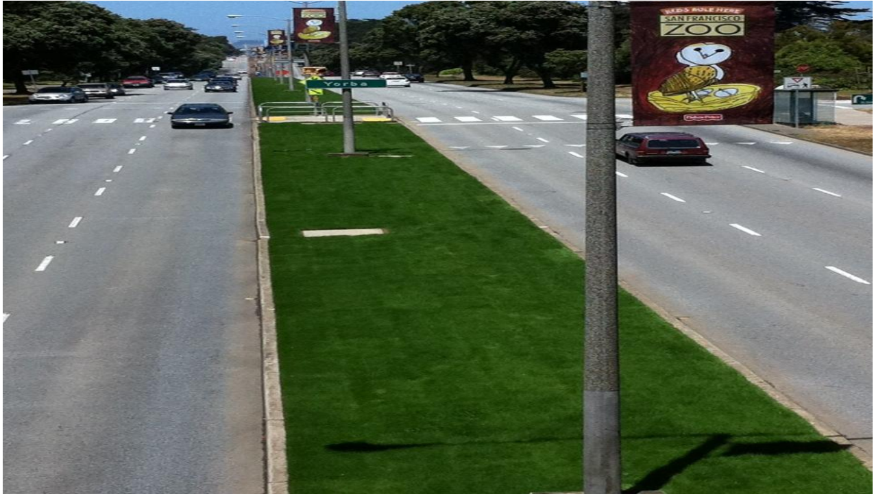
Native Bentgrass™ – Sunset Blvd. – San Francisco, CA

Keep mower blades well sharpened for the best cut. A dull blade tears at the grass which can weaken the turfs ability to fight off pests and disease. Sharpen blades a minimum of twice a year.